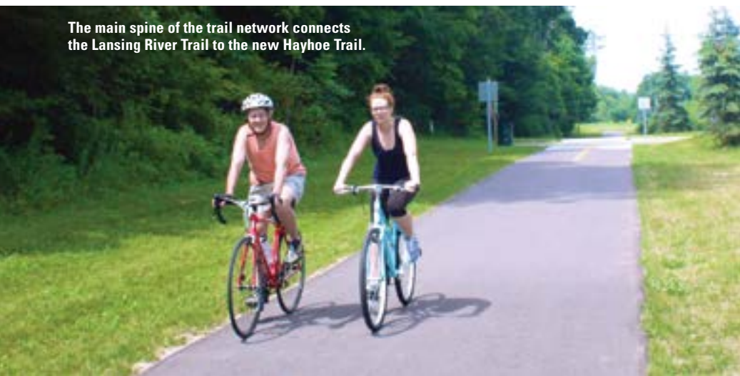
The main spine of the trail network connects the Lansing River Trail to the new Hayhoe Trail.

The 5.8-mile South Lansing Pathway is a paved nonmotorized trail stretching from Waverly Road through Benjamin Davis Park along a Consumers Energy utility corridor to Maguire Park, where it connects with the Lansing River Trail and the Sycamore Trail. From Maguire Park, a northeastern segment of the trail passes through Biggie Munn Park to the new Bear Lake Trail, where it will eventually be extended to Spartan Village on the MSU campus. This east/west interurban trail travels through a mostly residential area, giving local residents easy access to the entire Lansing area trail network. The trail was thoughtfully designed with signalized crossings, or HAWK signals, providing safe passage across busy streets.